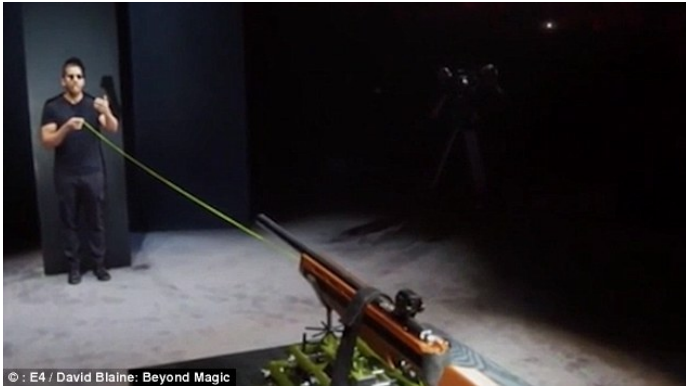
David Blain vs Chris Burden

The following is a list of images that describe the parallels and sometimes striking similarities between magicians or feats of performance magic and Live Art/Performance Art events.