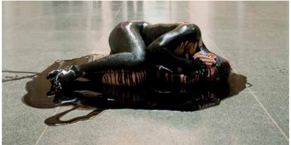
Liberate Tate, Human Cost , 2011, Photo: Amy Scaife

The Study Room Guide ends with this particular publication for a reason. I want to underline that such work by Liberate Tate - and