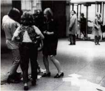
Guerilla Art Action Group, Call for the immediate resignation of all Rockefellers from the Board of Trustees of MOMA , 1969

Through the Forum, business sponsors' senior management - not the PR, community or corporate sponsorship staff - were required to engage in watching the performance, and then meet with the artists, directors, students and others in a closed session after the show. They were there to discuss the art as equals, in the spirit of mutuality, but also discuss the relation of sponsoring business to the art that had been sponsored. The key aim was mutual learning, to dissolve barriers between the sponsor, the artists and the work. This method made it impossible for the individuals representing the sponsor not to be implicated in the aesthetics, the issues, the economics and politics of the work sponsored, and vice versa. Due to the nature of the theatre groups involved, these conversations were often remarkable and transformatory for the individuals involved.