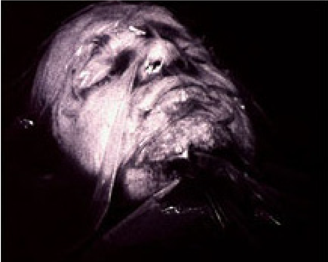
Stuart Brisley Museum of Ordure (2002)

not just a great joke, but a work with conceptual and aesthetic integrity that is about the nature and value of art, and the nature and value of the human condition. By placing the artist's body in all its functionality at the centre of the debate, Manzoni has been hugely influence on artists for generations to come.