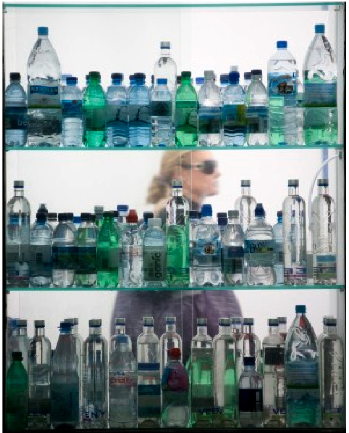
Tue Greenfort Condensation (2008)

For Frieze Art Fair 2008 the Danish artist Tue Greenfort excavated a chamber between gallery stands to present an installation that was literally a distillation of the essence of visitors to the fair. While inside a darkened room filled with the sound of waves, dehumidification equipment imperceptibly extracted moisture from unsuspecting visitors - collecting sweat and breath and pumping it through plastic tubing into recycled water bottles, visible in a glass-walled aperture. Greenfort wants us to think about our relationship with water, and the ecological wastefulness of drinking the fancy imported stuff.