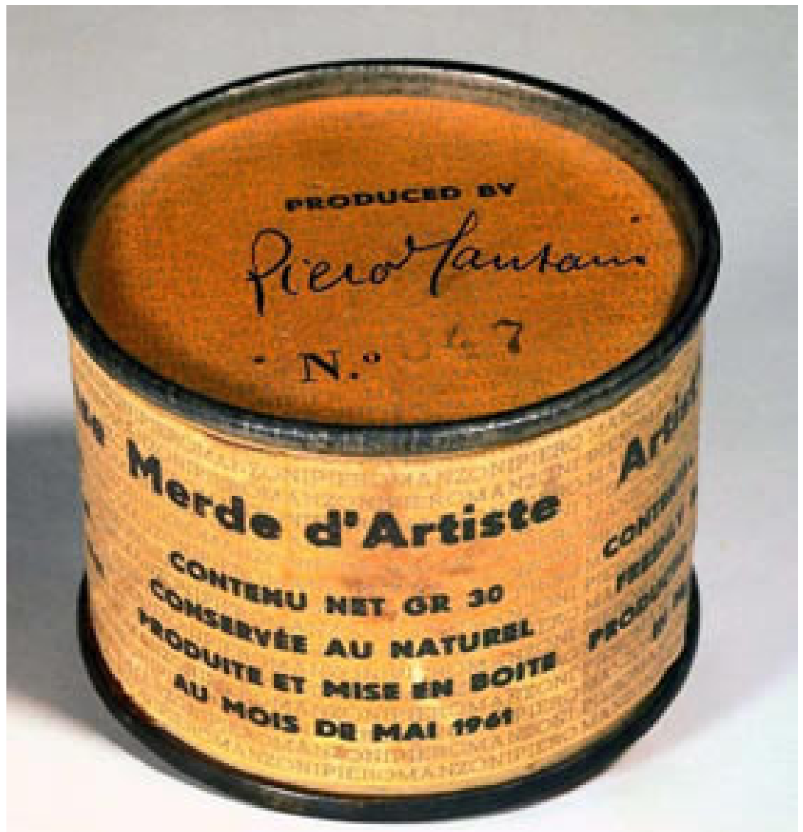
Piero Manzoni Merda d'artista (1961)

We're going to start with shit and the most famous of shit artists - Piero Manzoni. In Milan in the 60s Manzoni staged a series of radical exhibitions of multiples including Corpi d'Aria (Bodies of Air) - an edition of 45 balloons that could be blown up by the buyer, or the artist himself, and Fiato d'Artista (Artist's Breaths), a series of balloons, inflated and attached to a wooden base inscribed "Piero Manzoni- Artist's Breath". Continuing his explorations into the limits of physicality, whilst critiquing the Art World's preoccupation with permanence and commodification of ideas, in 1961 Manzoni created 90 small cans, sealed with the text Merda d'Artista (Artist's Shit). Each 30-gram can was priced by weight based on the current value of gold (around $1.12 a gram in 1960). According to Wikipedia one of the most recent cans to be auctioned, #19, sold on 26 February 2007 in the USA for $80,000 and, apparently, that "The contents of the cans remain a much-disputed enigma" (since opening them would destroy the value of the artwork). But I have no reason to doubt that the cans contain Manzoni's own shit - the cans are