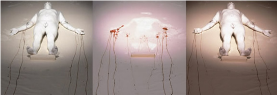
Franko B Oh Lover Boy (2001)

Working with sculpture, painting, photography, video and live action, the UK based Italian artist Franko B is at the forefront of artists testing not only the limits of the permissible in representations of the body, but the limits of the material body itself. In Franko B's live work his abject, naked, monochromatic and bleeding body is a site to express the sacred, the profane and the unspeakable and an invitation to witness the human condition at its most carnal, exposed and essential. In a culture where images of violence and extremity have become daily entertainment, Franko B employs his bleeding body as an affirmation of life and beauty and makes the unbearable bearable.