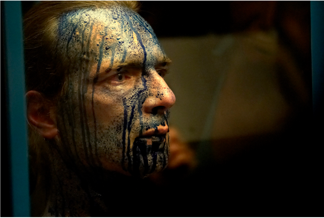
Yann Marussich Blue Remix (2008)

Blue Remix is an hour-long motionless performance by Swiss artist Yann Marussich sitting in a transparent container. A journey through the skin, the work externalizes the internal motion of his body through the ingestion of a large amount of methylene blue that gradually exits his body as his sweat. With thermal regulation and precise timings, Marussich creates a controlled biochemical choreography of methylene blue as it progressively seeps out of all the orifices in his body - from eyes, mouth and nose and eventually through the permeable membrane of the skin. By constructing a performance environment in which he is framed within a transparent box (like an art object) and remains motionless throughout he forces our attention is on the continuous inner movement of the body – of his body, of all bodies. As Brian Degger wrote in Transitlab about Marussich's performance at FACT, Liverpool "It is profound and scary, and extreme. His rigidity in the performance bellies the fact that as bodies we are always in motion, and in a disequilibrium with the surrounding environment. We are anything but sustainable, but our borders are semi-permiable".