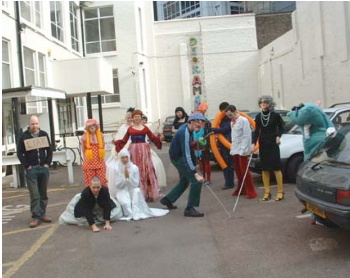
Costume in Live Art